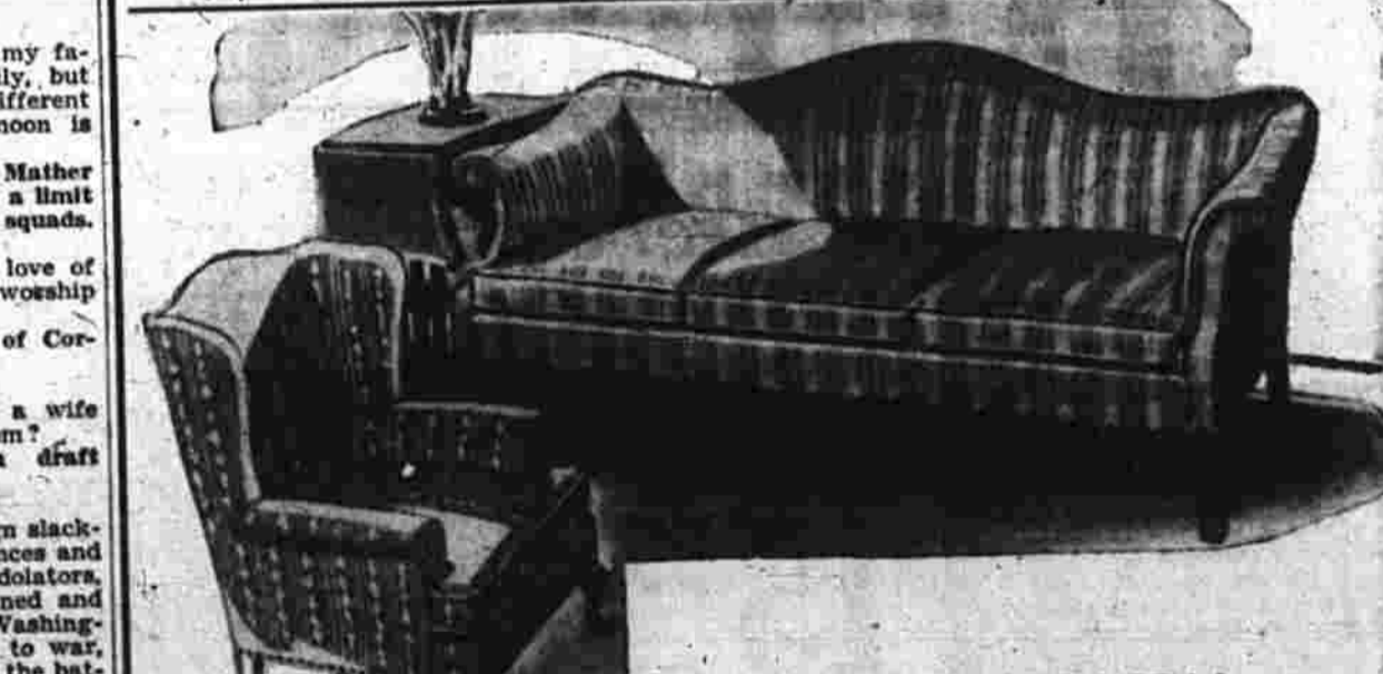
The CANTERBURY Group